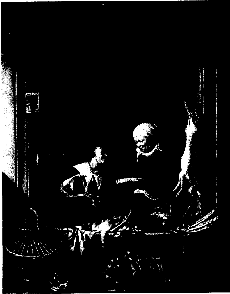
Gerrit Dou. A Poulterer's Shop , c. 1617. London, National Gallery of Art.

definition of the picture as a window through which an external viewer looks. On these accounts the Ptolemaic grid, indeed cartographic grids in general, must be distinguished from, not confused with, the perspectival grid. The projection is, one might say, viewed from nowhere. Nor is it to be looked through. It assumes a flat working surface. 27